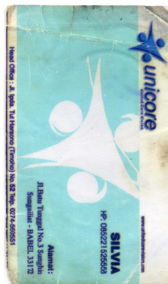
Lampiran B-3 Masukan Sistem Berjalan Kartu Nama