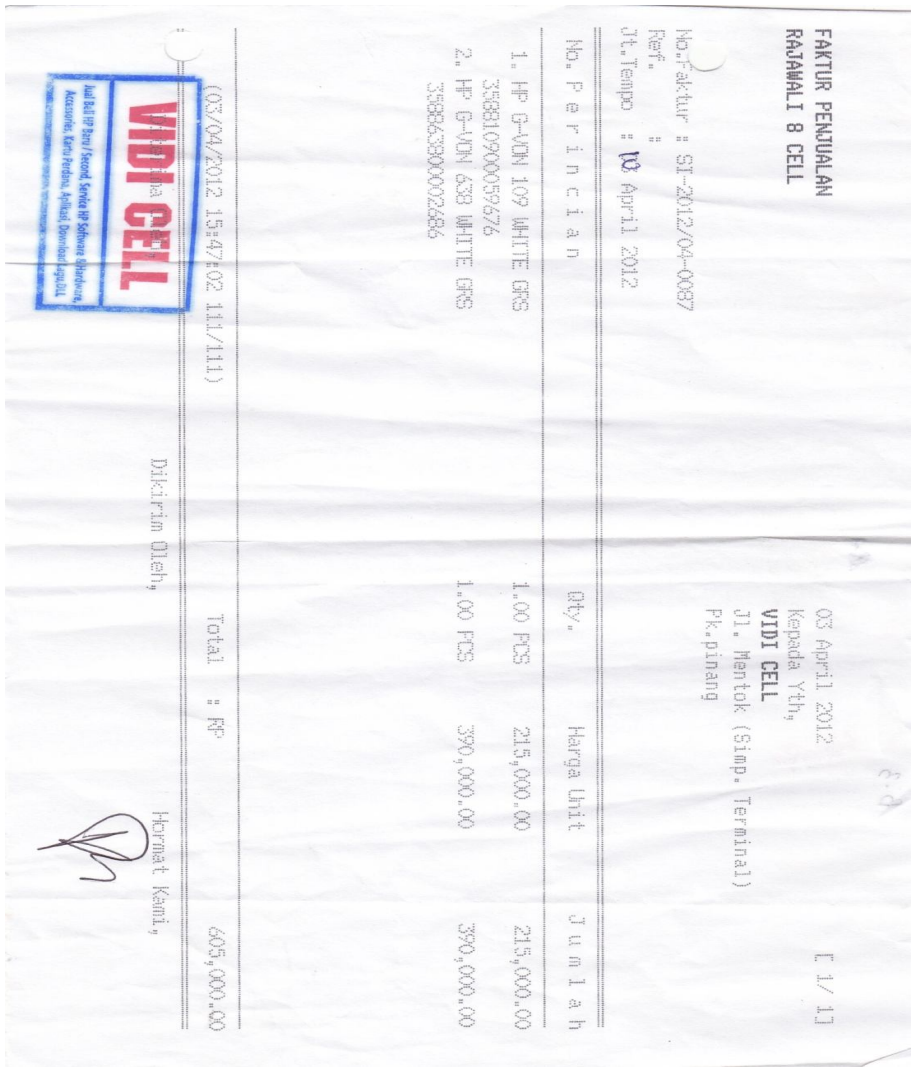
Lampiran B-3 Rancangan Masukan Faktur