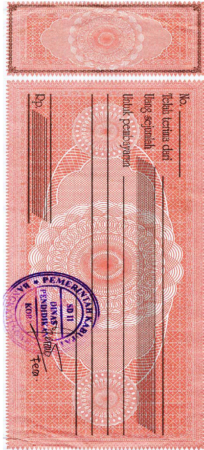
Lampiran A-2 Kwitansi