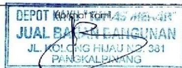
Lampiran A – 2 : Surat Jalan Keluaran Sistem Berjalan